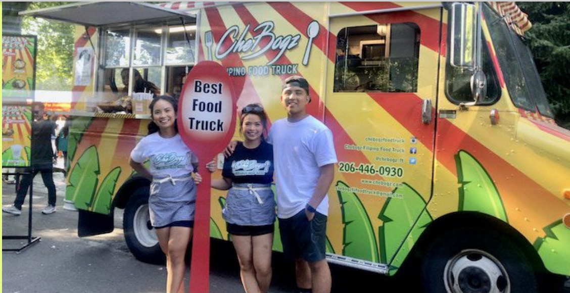
The CheBogz team winning Best Food Truck at the 2018 Bite of Seattle